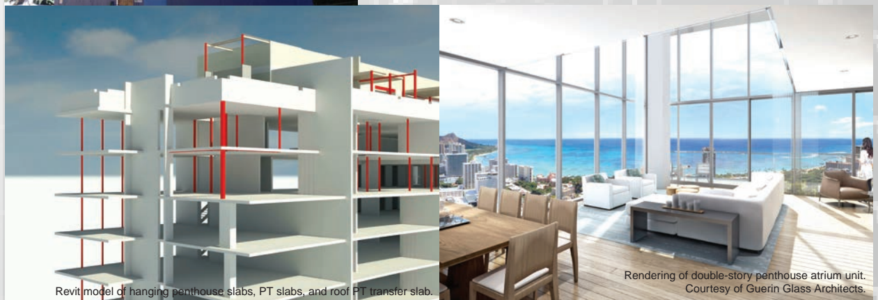
Revit model of hanging penthouse slabs, PT slabs, and roof PT transfer slab.

The penthouse levels were designed with some spectacular large double-story atrium spaces. The atrium openings were achieved by hanging partial floor PT slabs with steel hanger posts from the roof level. The roof slab not only had to support the loads from the hanging posts, but also the loads from heavy mechanical loads in the center and landscaped rooftop terrace and pool loads on the perimeter. The roof level transfer slab could only be achieved utilizing PT.